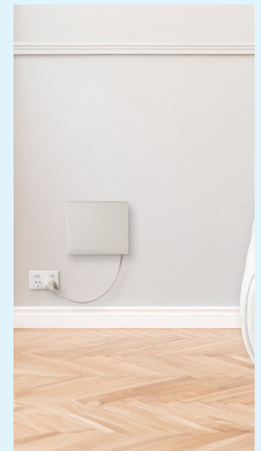
nbn connection box mounted on the inside surface of an external wall