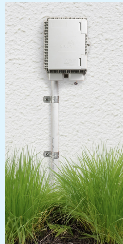
nbn utility box mounted on the surface of an external wall